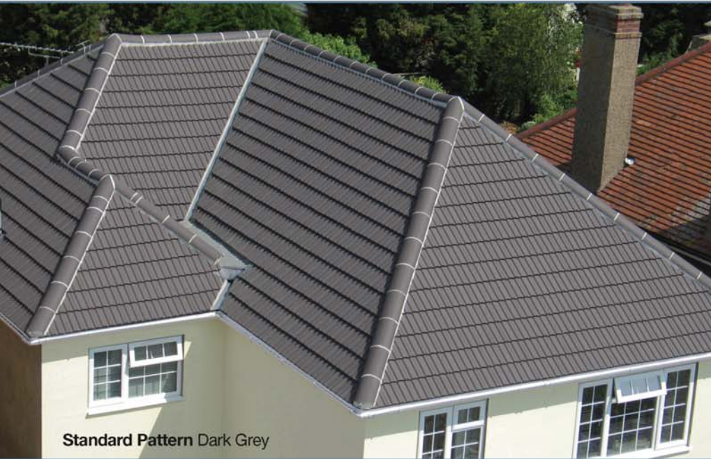
Standard Pattern Dark Grey