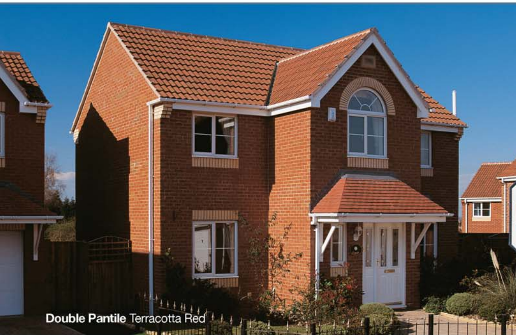
Double Pantile Terracotta Red

A high quality concrete tile that re-creates the flowing lines of a traditional pantile with an inherent strength in its curved design.